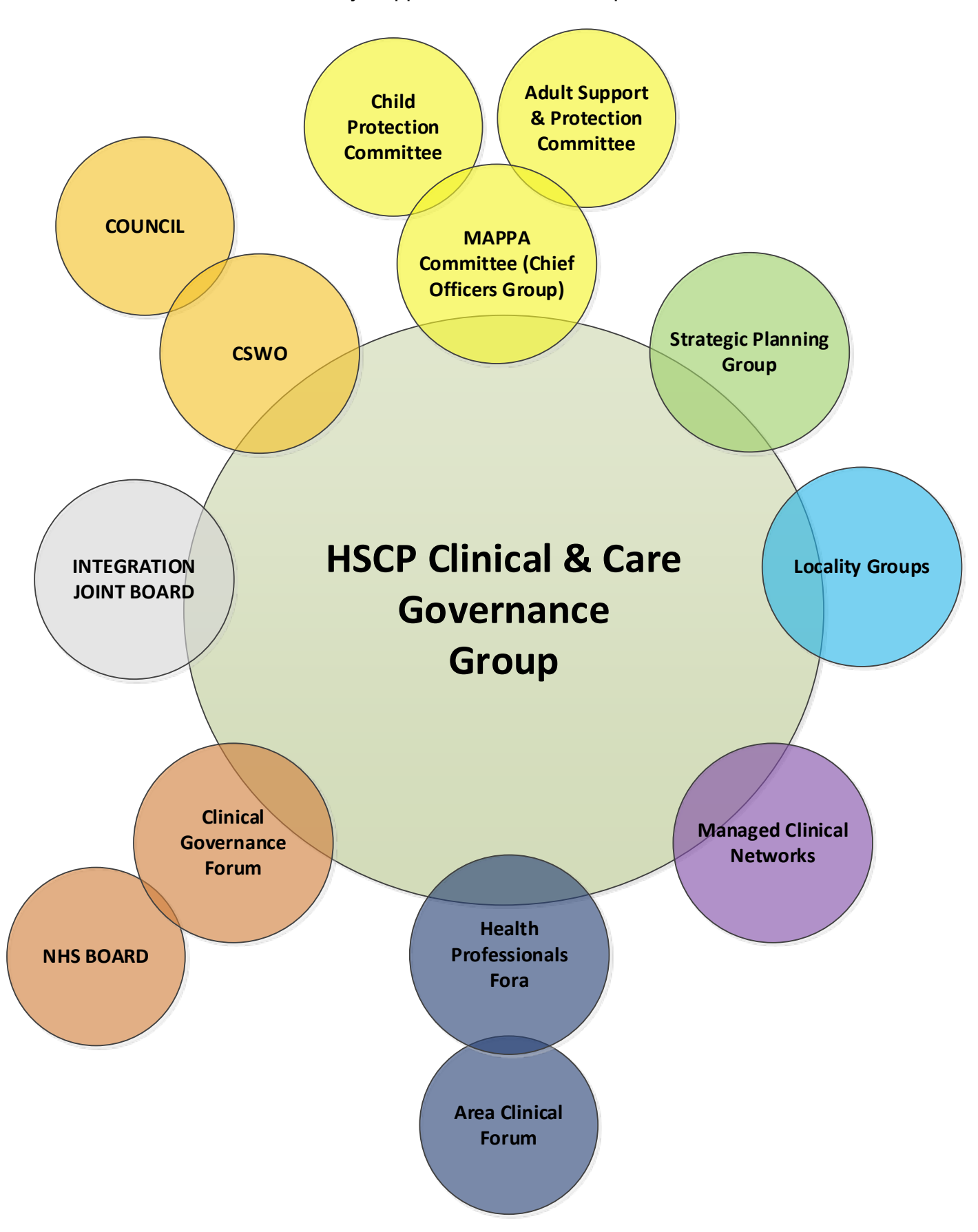
Annex 5 Clinical and Care Governance – Key Supports and Relationships